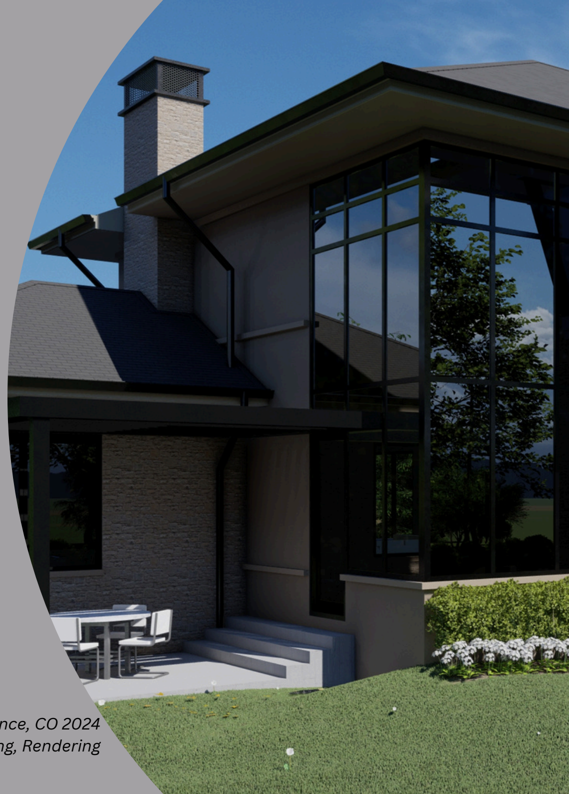
Obrien Residence, CO 2024 Drafting, Rendering